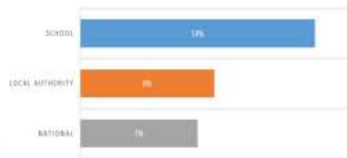
READING, WRITING AND MATHS GREATER DEPTH