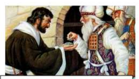
Judas betraying Jesus and accepting 30 pieces of silver