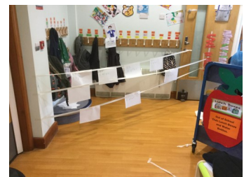
The crime scene!

Some of the children decided to investigate the mystery of the stolen toy car and cordoned off the crime scene whilst they collected statements.