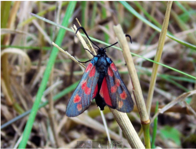
Jack (Y4) Lower Key Stage 2 winner

Many congratulations and very well done to all our winners.