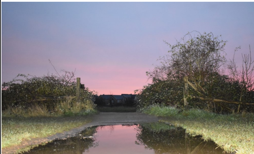
Ola (Y6) Upper Key Stage 2 winner