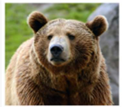
Brown bears are mammals.

Animals can be sorted into six different groups. These are mammals, amphibians, birds, fish, reptiles and invertebrates.