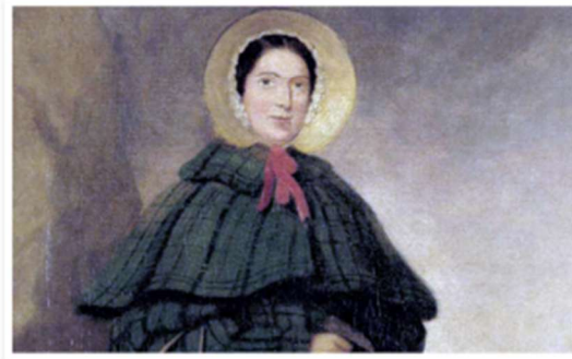
Portrait of Mary Anning

Mary Anning was a British palaeontologist, who was born in 1799. She made many important fossil discoveries.