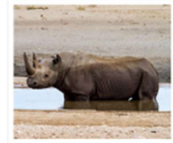
Western black rhino