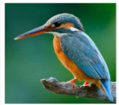
Kingfishers are birds.