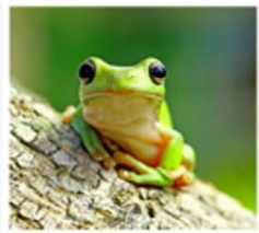
Frogs are amphibians.