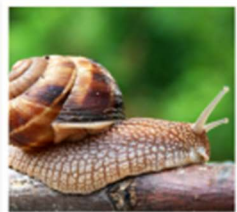
Snails are invertebrates.