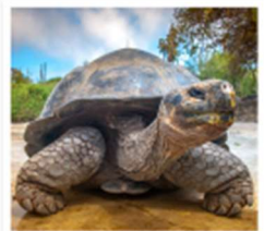
Tortoises are reptiles.