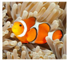
Clownfish are fish.