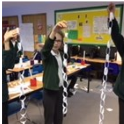
Chains of Friendship

themes as part of our recovery curriculum during the rest of the Summer term. Over the course of the afternoon, children explored the kinds of positive things that they could say to each other that could help them reconnect with friends again or possibly someone they don't ordinarily mix with. They also used team games to reinforce the importance of 'connecting with others' in an active context.