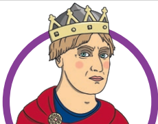
William the Conqueror